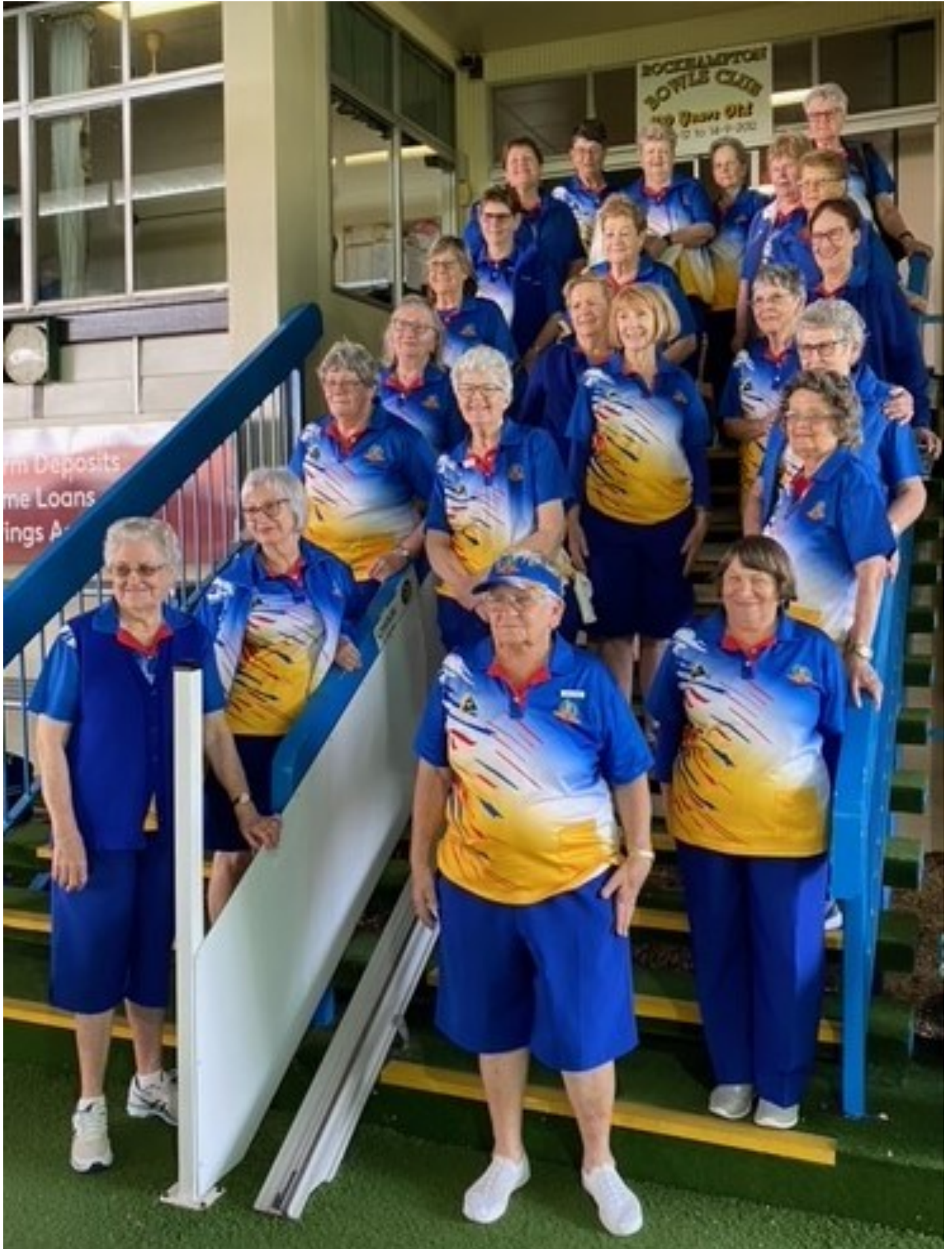
Players from RBC contesting the RBC Ladies' Classic Fours on Monday 16th September.